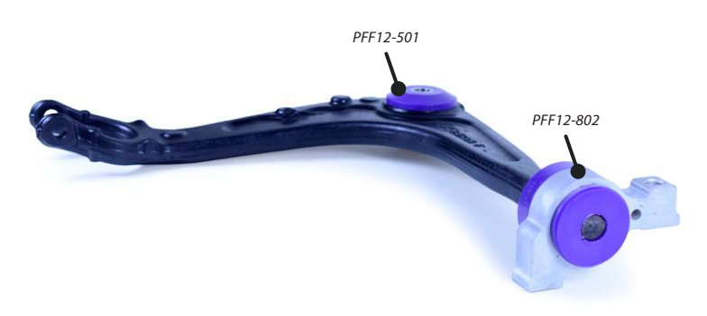
Figure 2 - fitted image showing PFF12-802 and PFF12-501

POWERFLEX +44 (0) 1895 460033 sales@powerflex.co.uk www.powerflex.co.uk